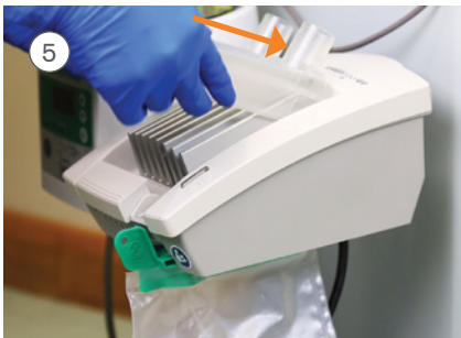
Insert the InterCooler cassette ensuring that the rear edge is located beneath the lip in the InterCooler base