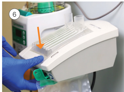
Push the cassette down and and the latch forward , ensure location by checking that the latch is flush with the front of the InterCooler housing (see fig.1 over the page)