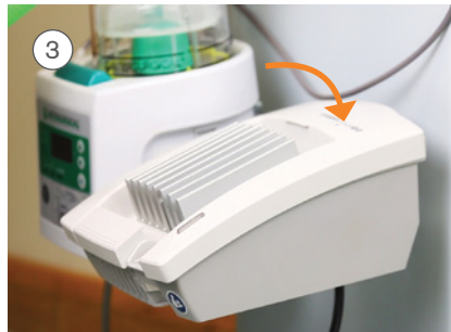
Mount the InterCooler on to the appropriate InterCooler bracket