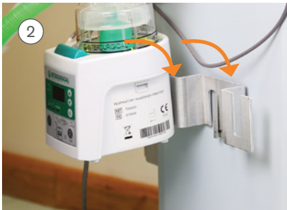
Mount the humidifier on to the appropriate InterCooler bracket

You will need: InterCooler unit , bracket , dual heated wire breathing system and InterCooler adapter kit