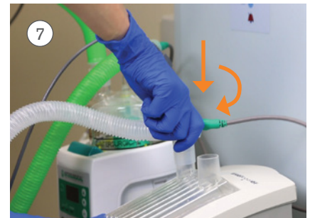
Connect the expiratory heated wire limb to the 22mm male connector of the InterCooler cassette