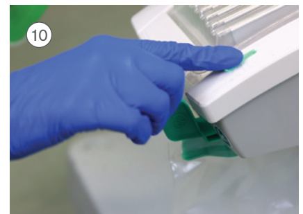
Turn on the InterCooler by pressing the power button . The button will illuminate green if the system is set up and functioning correctly