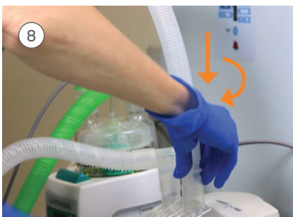
Connect the return limb to the 22mm female cassette connector