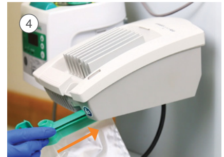
Insert the fluid collection bag into the InterCooler