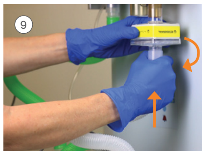
Connect the other end of the return limb to the ventilator . If filtration is required, use the 7-day Air-Guard Clear 7 filter