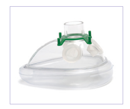
Anaesthesia • Anaesthetic Face Masks